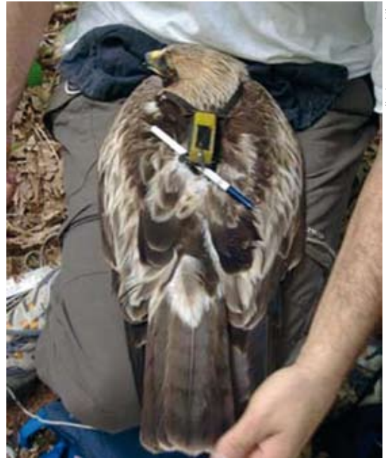
© Coll. Hiepen 2008 - O. Schiltz

Limousin and two juvenile Short-toed Eagles have been equipped with transmitters in Poitou-Charentes, allowing observers to follow their migration across the Strait of Gibraltar to Central-Western Africa (Nigeria, Mali, Burkina-Faso) and back. The GPS locations were pinpointed on Google maps and posted on the Conservatory's website.