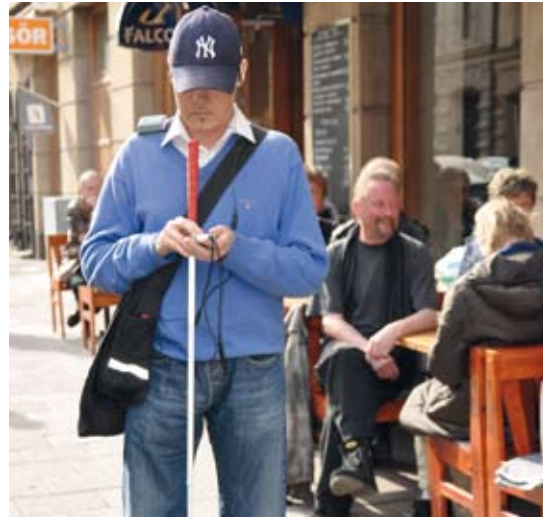
© City of Stockholm Traffic Administration

phones, adapted for the visually impaired, based on a city map of streets and roads and a GPS device connected to the mobile phone via Bluetooth.